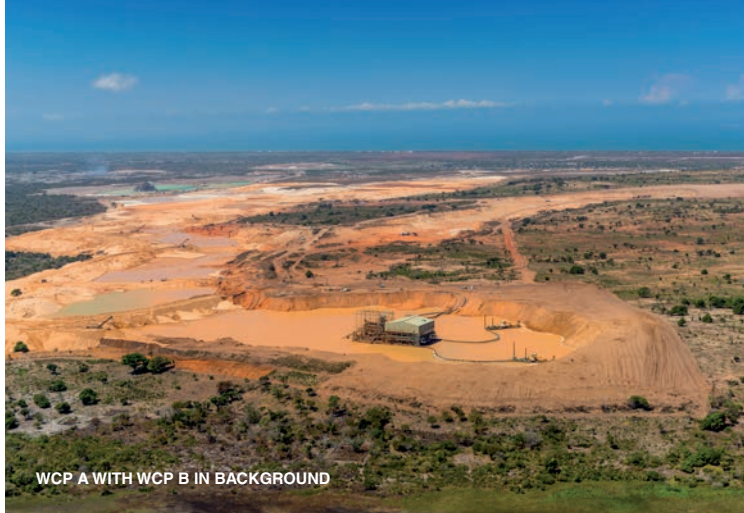
WCP A WITH WCP B IN BACKGROUND