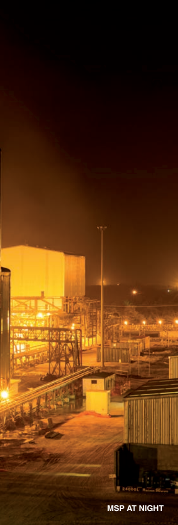
MSP AT NIGHT