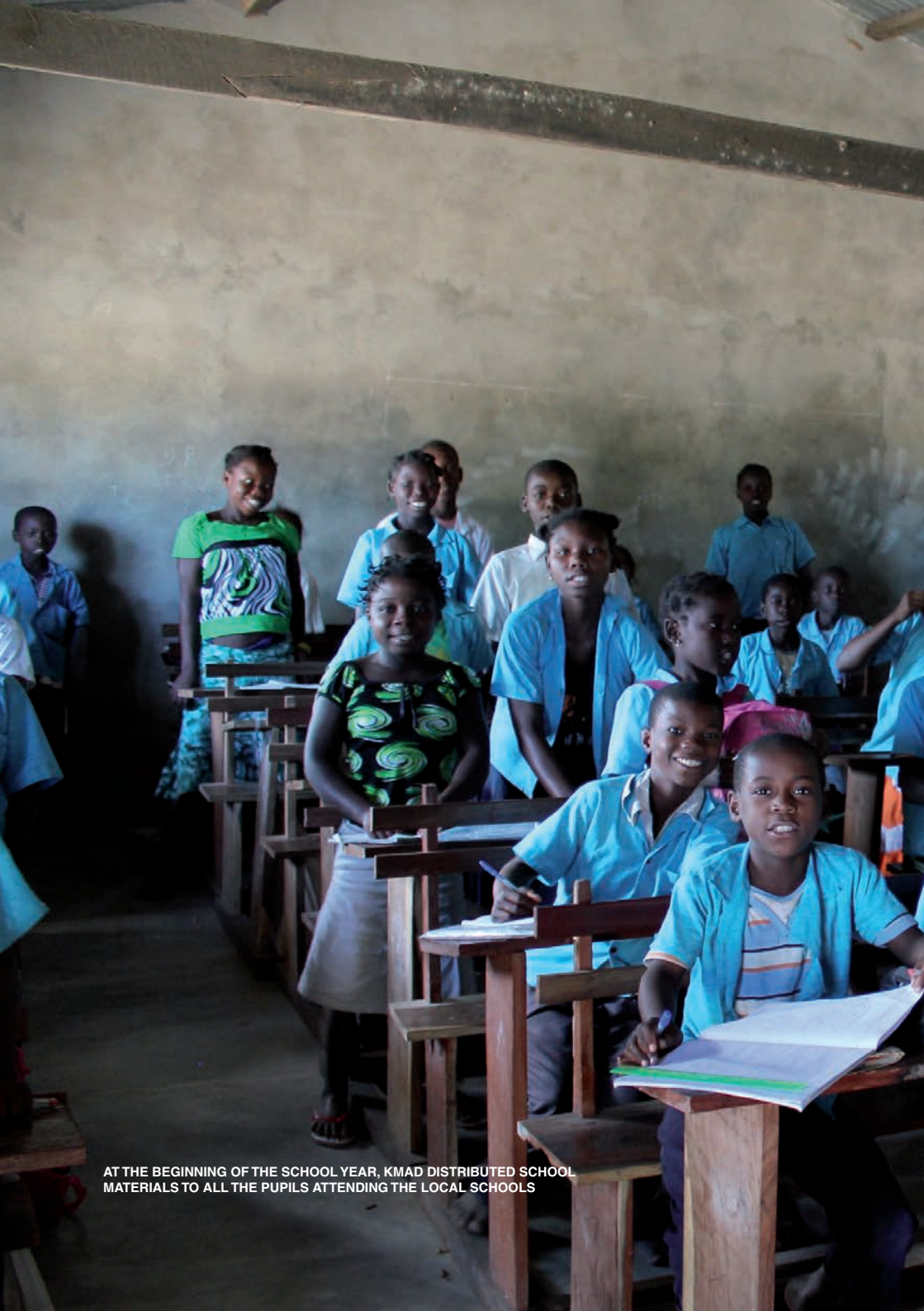
AT THE BEGINNING OF THE SCHOOL YEAR, KMAD DISTRIBUTED SCHOOL MATERIALS TO ALL THE PUPILS ATTENDING THE LOCAL SCHOOLS